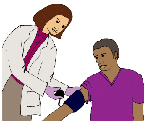
Good, safe care