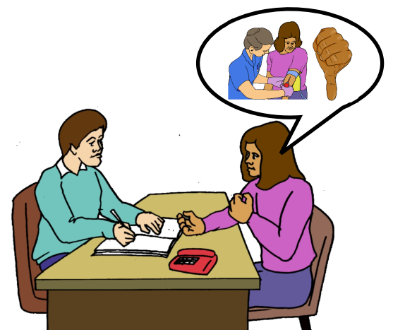
Feedback and complaints